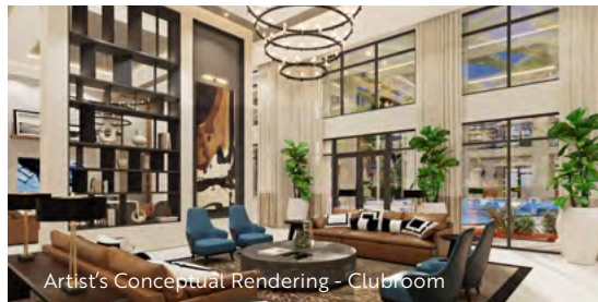
Artist's Conceptual Rendering - Clubroom